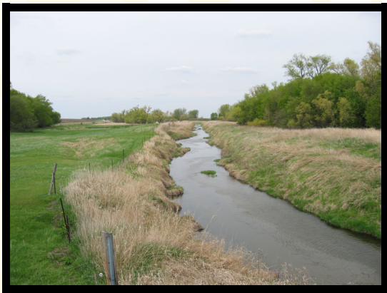
Buffalo Creek in Renville County