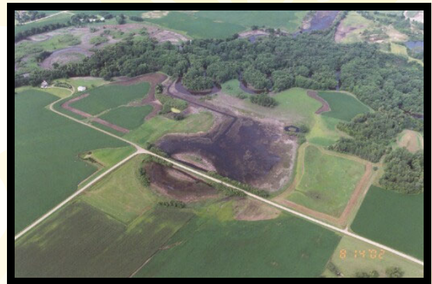
Buffalo Creek Flooding near Plato